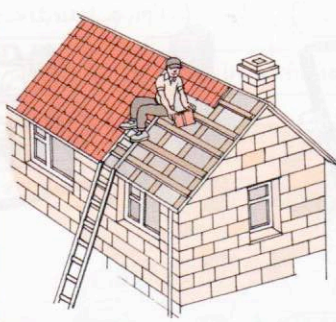
There's a man on the roof.